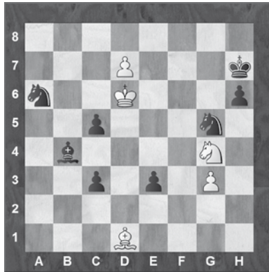
White to move is winning

Russian composition. Compared to music, it resembles the sophisticated fingering of the virtuoso violinist Niccolò Paganini. Maybe some reader will know something about the composer of this study. 2