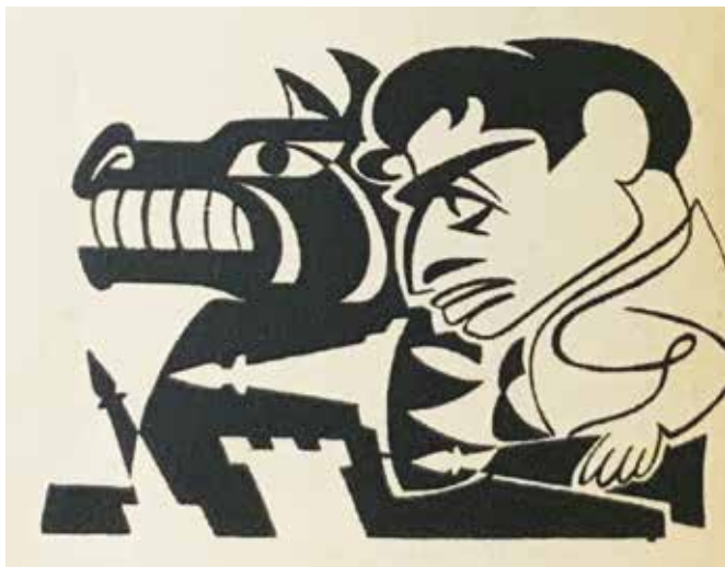
Mikhail Tal

In any case, for me there were only three brilliant world champions: Tal, Fischer and Kasparov. I was lucky to have lived to see them all.